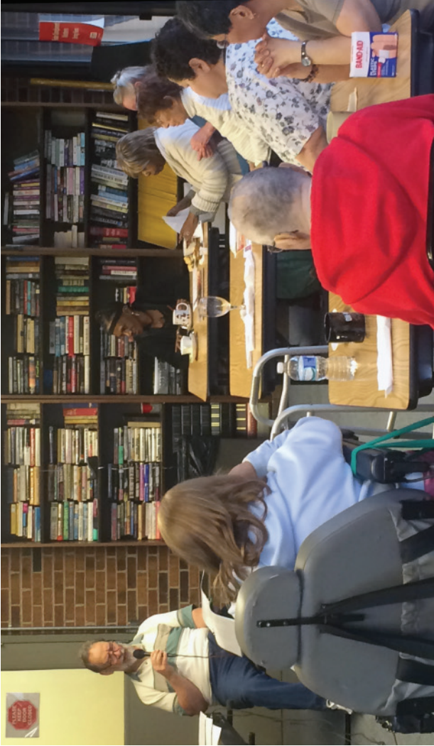
Scope: Senior Support Services