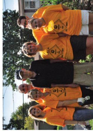
United Way at Work; Valley Healthcare staff assisting a Veteran