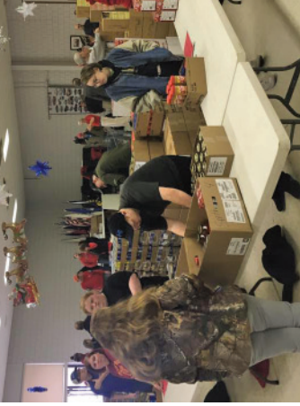
UAW 1112; distributing food for the holidays