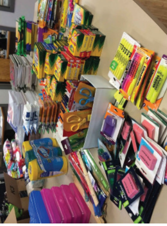
2nd Semester School Supply Drive; thanks to our partners Dollar General and O'Reilly Auto Parts