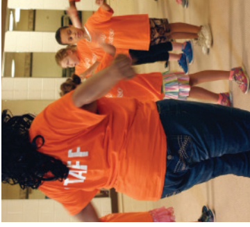
YWCA of Warren Before and After-School Program