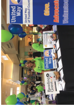
Showcasing Community Resources at Mercy Health Fair