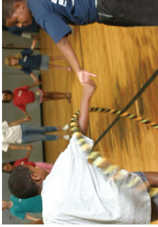
Trumbull Family Fitness Fit Family Program