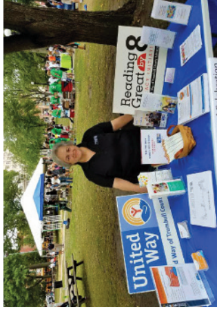
Celebrating "Back to School" in Warren Courthouse Park