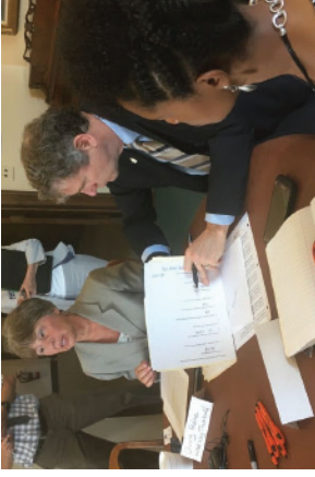
Meeting with Senator Sherrard Brown to discuss the effects of payday and title lending on clients who are served by members of the Trumbull County Partnership for Financial Empowerment.