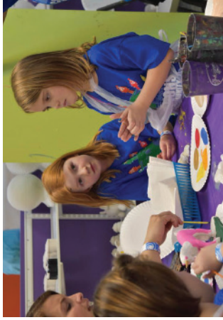
Girl Scouts Leadership Program