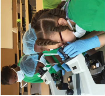
Inspiring Minds Enrichment Program