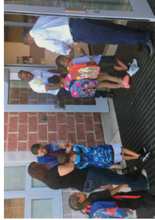
First Day of School; Welcoming students and sharing UW "Think We before Me" wristbands