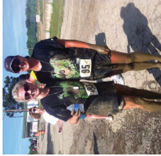
Mud Monster 5K; Getting Muddy for a good Cause