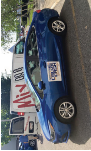
General Motors Lordstown promoted Greenwood's Cruze or Cash incentive at both Local 1112 and 1114 plants and continued to do so during GM's 50th Anniversary Celebration.