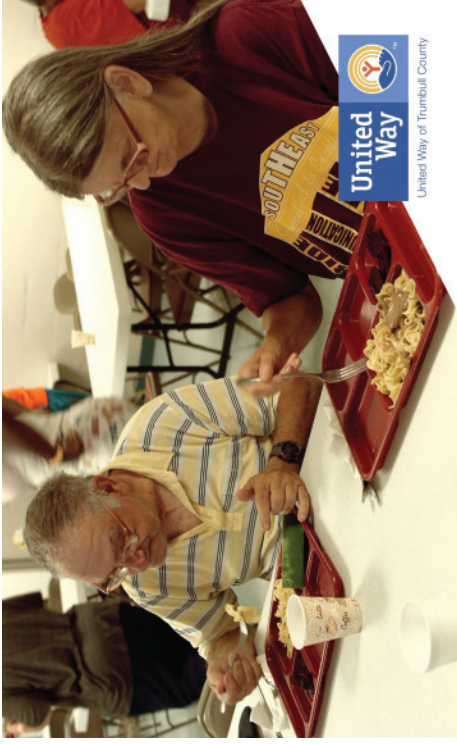
Salvation Army of Warren Basic Human Needs

Trumbull ★ 2-1-1 ™ Get Connected. Get Answers.