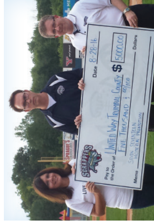
Scrappers' Home Run Derby; thanks to our partners Seven Seventeen Credit Union