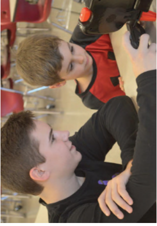
Big Brothers Big Sisters Mentoring Program