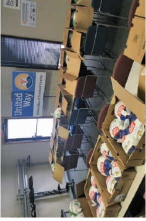
Giving Tuesday's Dine Out Event; provided holiday turkeys for those in need