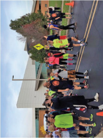
6th Annual Great Pumpkin 5K; Kent State Trumbull