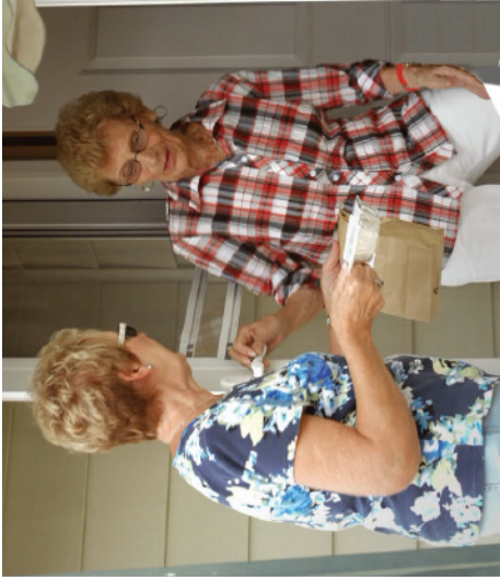
Trumbull Mobile Meals Sliding Scale